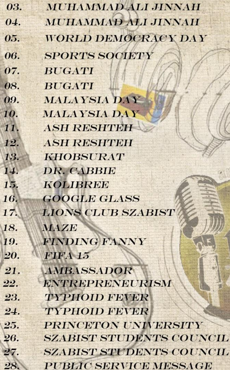
TABLE OF CONTEST